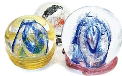
Unique Cremation Offerings